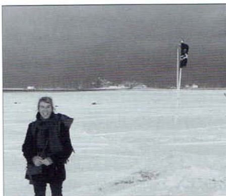
Continuing snow through Belgium

My walk in Belgium led me through a snowy beach and a snowy forest. Looking at the road ahead of me, vanishing in a haze of