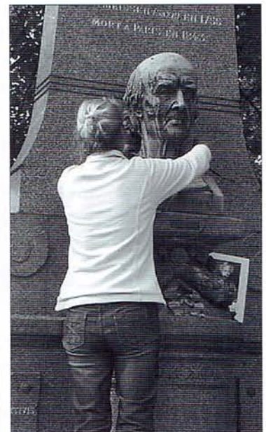
The trek ends!